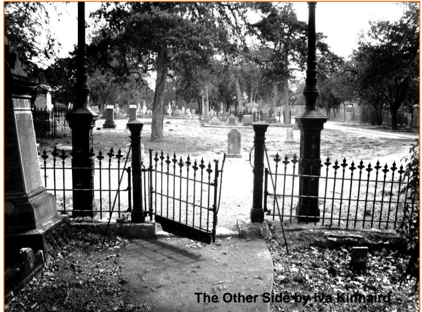
The Other Side by Iva Kinnaird

THANK YOU to all those shutterbugs who entered the contest and CONGRATULATIONS to those photos that received the top votes. Thanks for helping SAC increase public awareness and appreciation of the artistic and cultural value of Austin's city cemeteries.