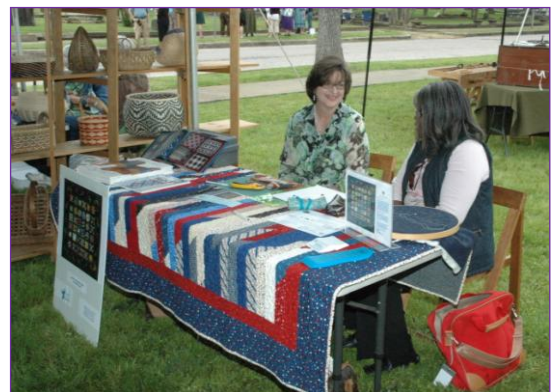
Some of the terrific demonstrators