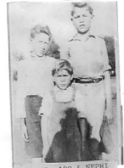
ETHER, ADO & NEPHI